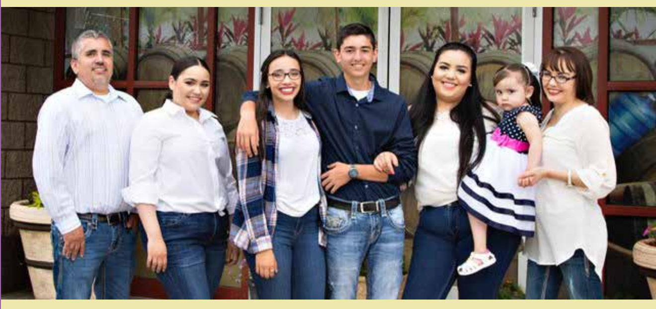
Proud to serve you, thank you for your business! -The Navarro family

1733 PINE RD SOUTH SARTELL, MN 56377 320.252.1000